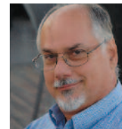
President of the Organising Committee