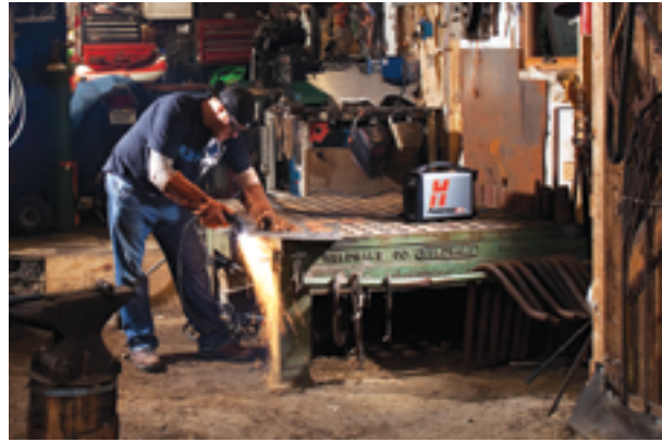
Home hobby and metal art

HVAC, agricultural, property/plant maintenance, fire and rescue, general fabrication, plus: